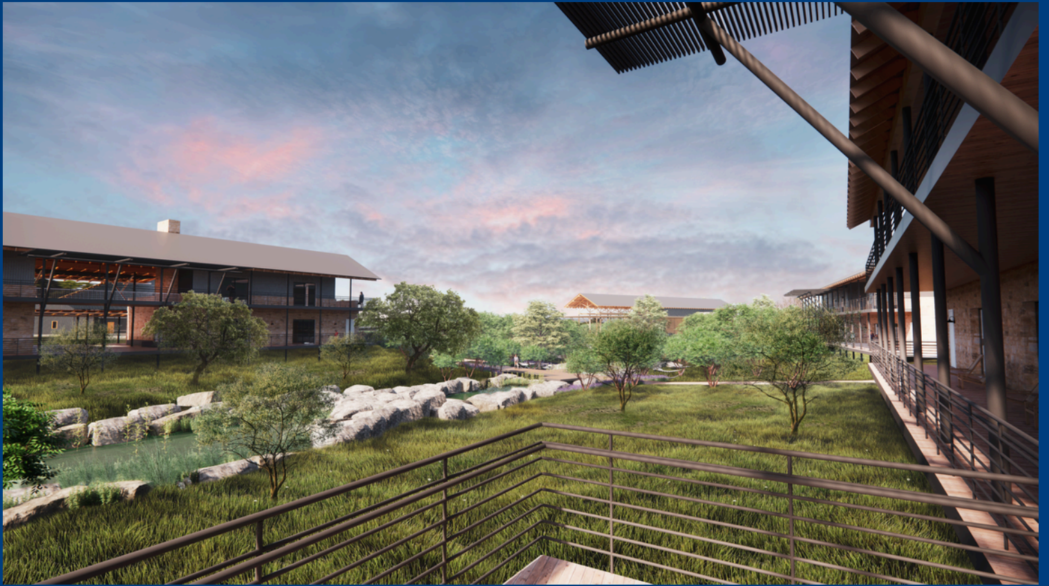
Family Camp Cabins