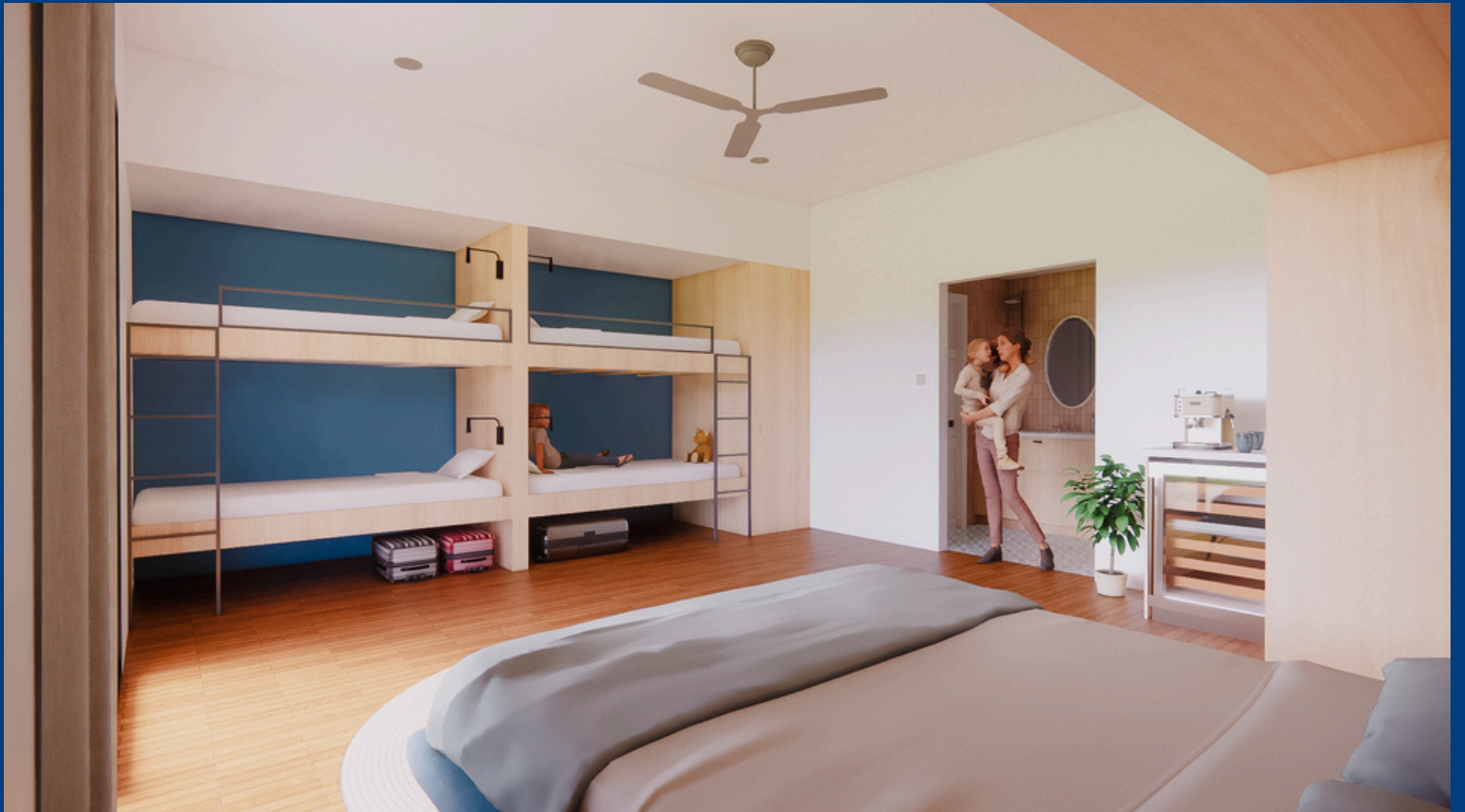
Interior of Family Camp Cabins